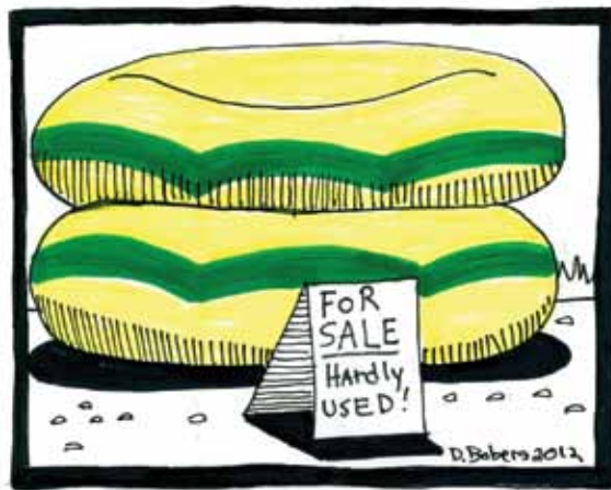
Yikes. Tubing Season is over!